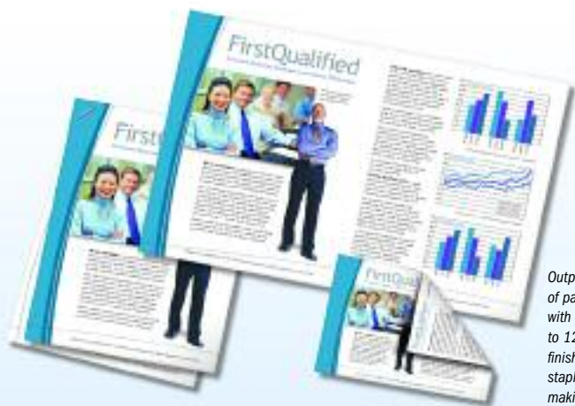
Output to a variety of paper stocks — with sheet sizes up to 12" x 18" — and finish by holepunching, stapling, booklet-making and more

The CL7300 and CL7200 Series go beyond simple paper shuffling. Thanks to custom configuration capability, workgroups can enjoy the exact paper handling design that suits their needs. The flexibility continues with a 3,100-page total paper capacity , and the ability to process up to 90 lb. index stock and 12" x 18" paper through the bypass tray for full-bleed, 11" x 17" printouts.