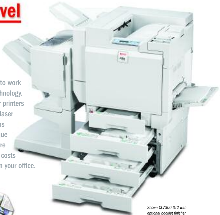
Shown CL7300 DT2 with optional booklet finisher

Professionals everywhere face the same challenge: How can I be more productive with fewer resources to work with? The answer: Make smarter investments in technology. The Ricoh® Aficio® CL7300 and CL7200 color laser printers allow you to do exactly that. These innovative color laser printers combine the most desirable printer functions with advanced finishing features to create truly unique offerings in today's printing marketplace. Not only are they functionality rich, but they also keep operating costs low to make color printing affordable for everyone in your office.