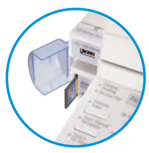
Take your documents on the go with the easy and convenient Scan-to-Media option.

Forward incoming faxes to an e-mail address or folder, so users can receive important documents no matter where they are.